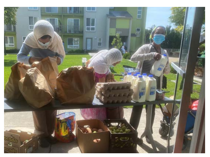
Seniors have access to supplemental food.