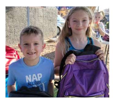
EDUCATION FOR YOUTH