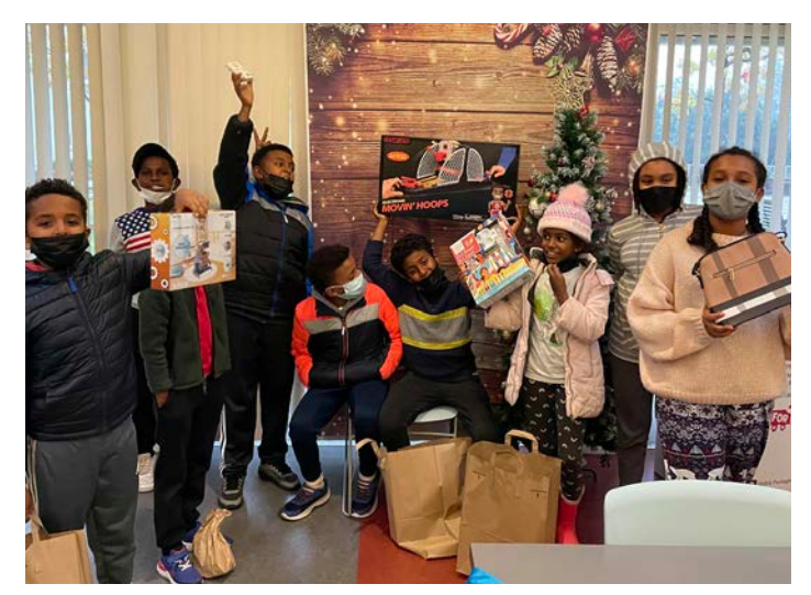
Youth received a new toy during the holidays.