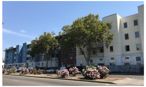
Figure 2: Acts Cyrene Apartments

OHA partnered with Related California and Acts Community Development Corporation to develop Acts Cyrene Apartments, a 59-unit multifamily housing complex located at 94<sup>th</sup> Avenue & International Boulevard. The 1.26 acre site now houses a 4-story slab-on-grade building with retail space, a community room, and social service space for the residents. The project reserved 14 of the units for homeless/formerly homeless households. Using MTW flexibility, OHA purchased the land and provided additional funds for the construction and permanent funding sources. The residential portion of the building will be managed by Related and Acts