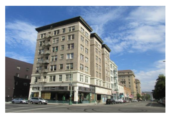
Figure 5: Empyrean Towers

In 2017, OHA awarded 636 PBVs through RFQ #16-008 across 20 projects and during FY 2018 OHA leased the first 105 of these units. The number of leased vouchers was lower for some projects due to some families not meeting the eligibility criteria for the PBV program or opting not to participate. In an effort to minimize displacement of existing families, fewer vouchers were leased than was planned as shown in Table 1. Additional projects that were conditionally awarded PBVs through the RFQ were planned to be leased in FY 2018, but remained in the "Committed" status as shown in Table 1, due to